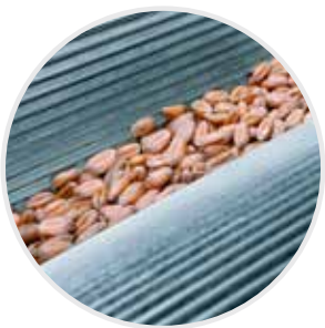
In the Mill