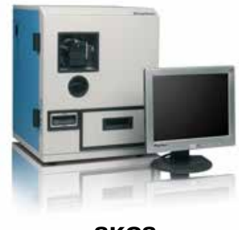
SKCS Single kernel testing for wheat uniformity

The BVM uses laser topography to rapidly measure accurate dimensions (length, width, depth), weight and volume of bread and baked products. The software generates a 3-D rotatable diagram of the product and stores all results – including the 3-D model. Performance is nearly 5 times more accurate and 10 times faster than seed displacement tests and the method is standardized in the AACCI 10-14.01 method. Millers and bake labs use the BVM to measure pup loaf volume. Results are archived for claims and audits. The BVM has accessories to measure many products such as pan and hearth breads, small rolls, hamburger buns, cookies, pizza, flat bread, pastries, muffins, and cakes. The BVM is an essential tool for test bakeries and test kitchens to prove the performance of flour, wholemeal, bread improvers and ingredients.