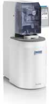
Falling Number® Sprout damage detection & malt addition