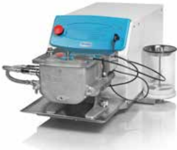
doughLAB Water absorption & mixing characteristics