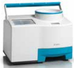
IM 8800 Portable Grain NIR Analyzer