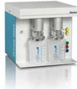
Glutomatic® Gluten quantity & quality