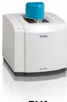
RVA Starch pasting characteristics