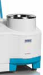
Inframatic 9500 Rapid grain analyzer with capabilities