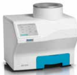
AM 5200 Grain Moisture Meter

savings are realized by simultaneously increasing yield, reducing rejects, and increasing end-product quality and consistency. In-line monitoring using the DA 7300 provides many benefits: