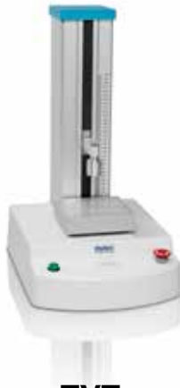
TVT Texture analysis